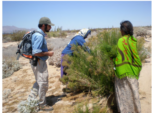
FIGURE 1. Ambrosia salsola , called by the Seri caasol cacat . A tea made with the stem is used to heal swollen parts of the body and respiratory ailments. The tea can also be used as a topical solution against skin infections and as a wound cleanser. In recent years, Seri women use A. salsola as raw material to create medicinal soaps which they sell to outsiders.

The association between aposematic coloration and toxicity is noticeable, yet poorly described to the present date. Nonetheless, it is clear that the link between toxicity and aposematism results from the interactions between complementary morphological and physiological processes. Therefore, one can